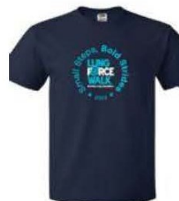
Official LUNG FORCE Walk T-Shirt