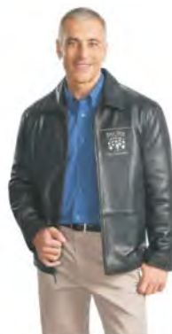
Port Authority® Park Avenue Lambskin Jacket