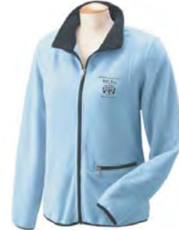
Chestnut Hill Ladies' Microfleece Full-Zip Jacket