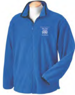
Chestnut Hill Men's Microfleece Full-Zip Jacket