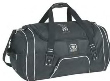
OGIO Rage Duffel

Constructed of 300-denier dobby nylon/600-denier poly, the Rage is engineered to hold enough for days of serious travel with a huge cargo compartment and a wide opening. It features: a front zippered pocket, ventilated shoe compartment with grab handle, custom-molded handle, side-zippered accessory pocket, padded shoulder strap and all metal hardware.