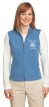
Port Authority® Ladies Activo Microfleece Vest

logoed microfleece vest or dinner for 2 at Bristol Bar & Grille (Louisville) or dinner for 2 at Sal's Italian Chophouse (Lexington)