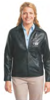
Port Authority® Ladies Park Avenue Lambskin Jacket

Our premier leather jacket is fashioned from supple, top grain lambskin. Subtle horizontal-stitched shell matches your lifestyle—from office to evening—with endless versatility.