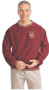
Port Authority® Ultra-Soft Microfiber Wind Shirt

Logoed microfiber windshirt or dinner for 2 at Varanese Restaurant (Louisville) or Holly Hill Inn (Midway)