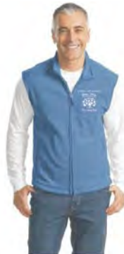
Port Authority® Activo Microfleece Vest