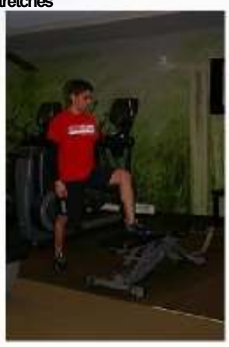
Front Hip stretches With one foot on a step, lean forward until a stretch is felt in front of hip, then lean back.