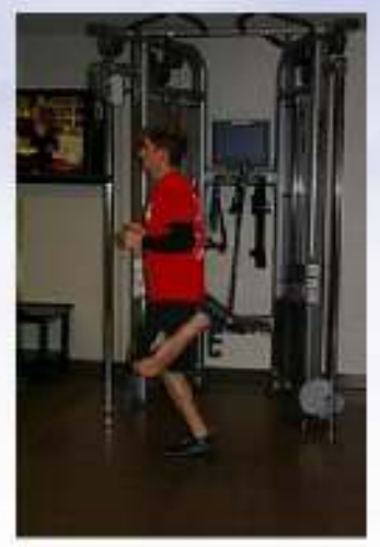
Walking Marching Jogging