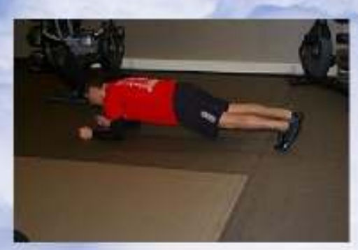
Plank: Core Strengthening, hold 10 seconds.